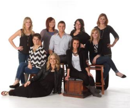
DENTAL HYGIENE—Class of 2015