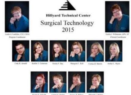
SURGICAL TECHNOLOGY—Class of 2015