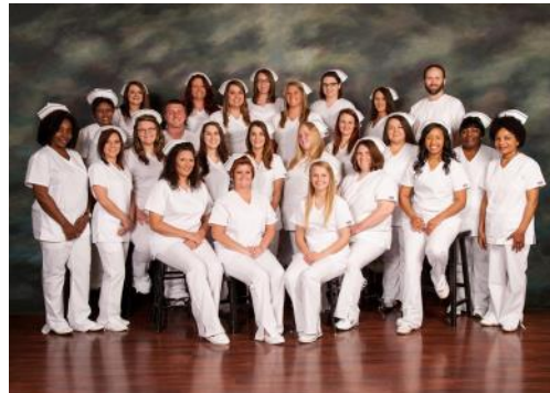
PRACTICAL NURSING—Class of 2015